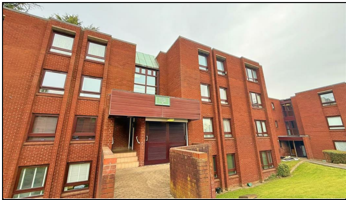
Hazel Court, Four Oaks,